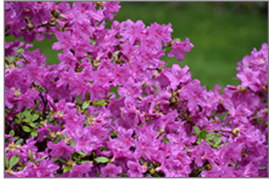
Karen Azalea flowers