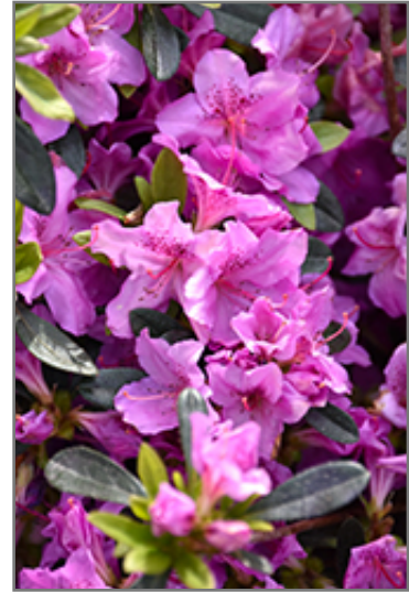
Karen Azalea flowers