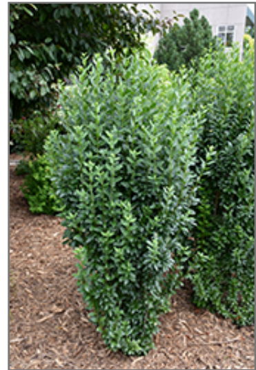
Straight Talk Privet