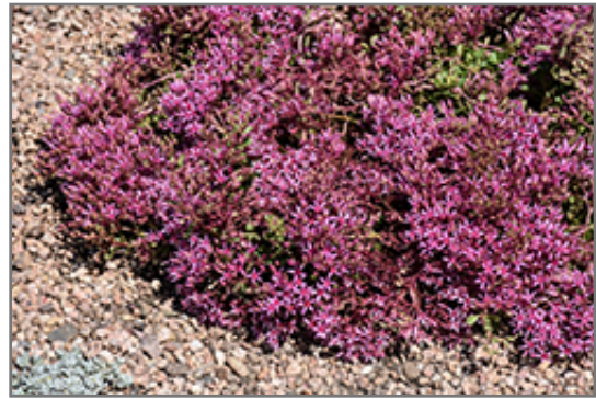
Dragon's Blood Stonecrop flowers

This plant will require occasional maintenance and upkeep, and is best cleaned up in early spring before it resumes active growth for the season. Deer don't particularly care for this plant and will usually leave it alone in favor of tastier treats. Gardeners should be aware of the following characteristic(s) that may warrant special consideration;