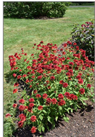
Double Scoop Orangeberry Coneflower in bloom