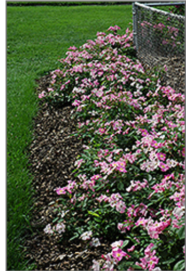
Nearly Wild Rose in bloom

Nearly Wild Rose makes a fine choice for the outdoor landscape, but it is also well-suited for use in outdoor pots and containers. With its upright habit of growth, it is best suited for use as a 'thriller' in the 'spiller-thriller-filler' container combination; plant it near the center of the pot, surrounded by smaller plants and those that spill over the edges. It is even sizeable enough that it can be grown alone in a suitable container. Note that when grown in a container, it may not perform exactly as indicated on the tag - this is to be expected. Also note that when growing plants in outdoor containers and baskets, they may require more frequent waterings than they would in the yard or garden. Be aware that in our climate, most plants cannot be expected to survive the winter if left in containers outdoors, and this plant is no exception. Contact our experts for more information on how to protect it over the winter months.