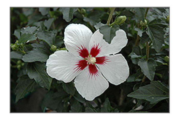
Lil' Kim Rose of Sharon flowers

Lil' Kim Rose of Sharon is recommended for the following landscape applications;