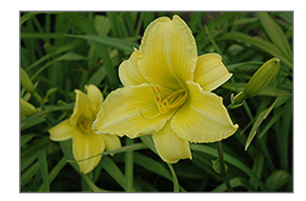
Eenie Weenie Daylily flowers