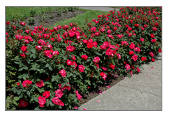
Knock Out Rose in bloom

24900 Cherry Hill Rd. Elwood, IL 60421 Office Phone: 815-723-1140 Office Fax: 815-723-6609