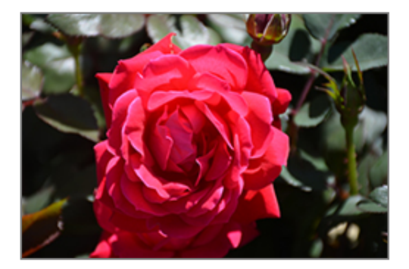
Knock Out Rose flowers

Knock Out Rose is a multi-stemmed deciduous shrub with a more or less rounded form. Its average texture blends into the landscape, but can be balanced by one or two finer or coarser trees or shrubs for an effective composition.