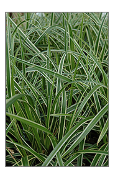
Ice Dance Sedge foliage