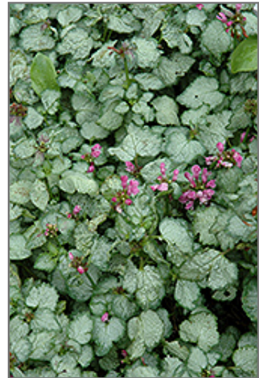
Beacon Silver Spotted Dead Nettle flowers