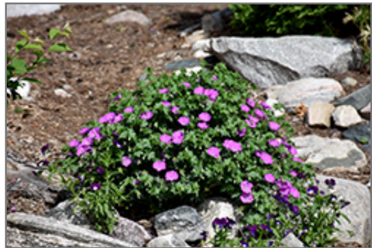
Bloody Cranesbill in bloom