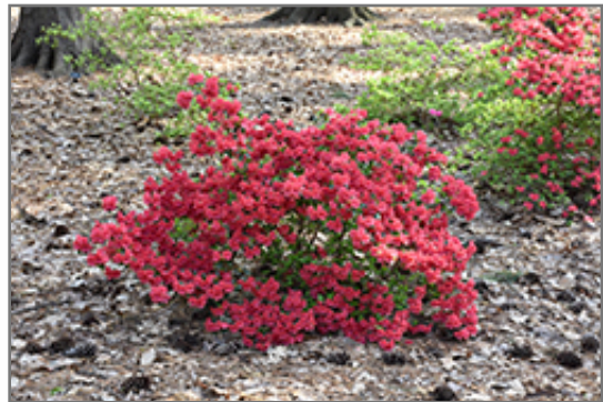
Girard's Crimson Azalea in bloom