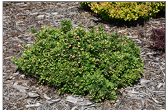
Moscato Barberry