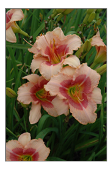
Exotic Candy Daylily flowers

Ruffled, very fragrant light pink flowers with dark rose eyes and bright yellow-green throats; re-blooming; great grassy texture and form; an elegant color addition to the garden or border