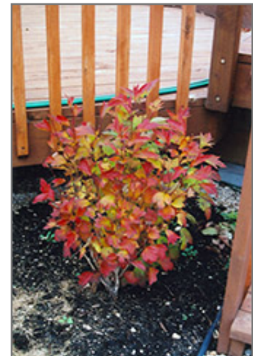
Compact Highbush Cranberry in fall