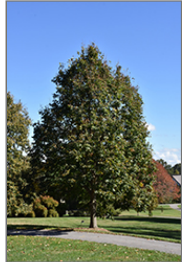
Redmond Linden