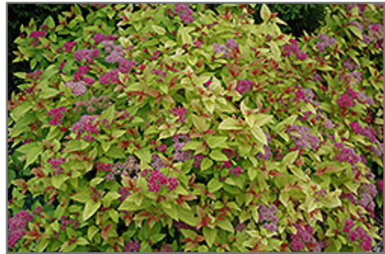
Magic Carpet Spirea flowers