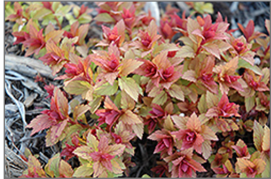
Magic Carpet Spirea foliage

Magic Carpet Spirea will grow to be about 24 inches tall at maturity, with a spread of 3 feet. It tends to fill out right to the ground and therefore doesn't necessarily require facer plants in front. It grows at a fast rate, and under ideal conditions can be expected to live for approximately 20 years.