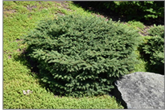
Birds Nest Spruce